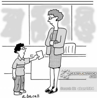
"Here is my absence note. I had Spring fever."

Yes, spring fever is a real phenomenon. When the outdoor temperature rises, your blood vessels expand. As a result, blood can be carried to the body surface where heat can be lost quickly, giving some people an energetic "spring" in their step.