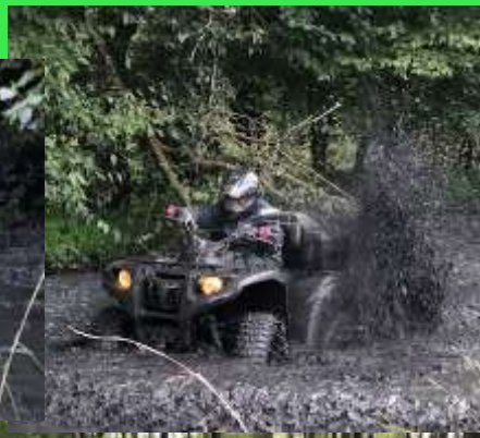
A NEW LEVEL OF MUDDY