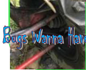
Bugs Wanna Have Fun