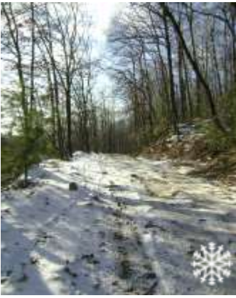
Trail 3~Snow, Snow, Snow!